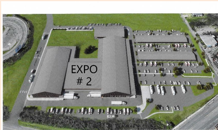
Exposition Facilities Draft Rendering | November 1, 2018

Featuring: OPERATING LAYOUTS VENDOR SUPPLIED REPLACEMENT PARTS OVER 200 AVAILABLE TABLES OF TRAINS DRAWING FOR DOOR PRIZES ALL DAY 5 NEW TRAIN SET DOOR PRIZES FOR KIDS ONLY SNACK BAR OPEN ALL DAY